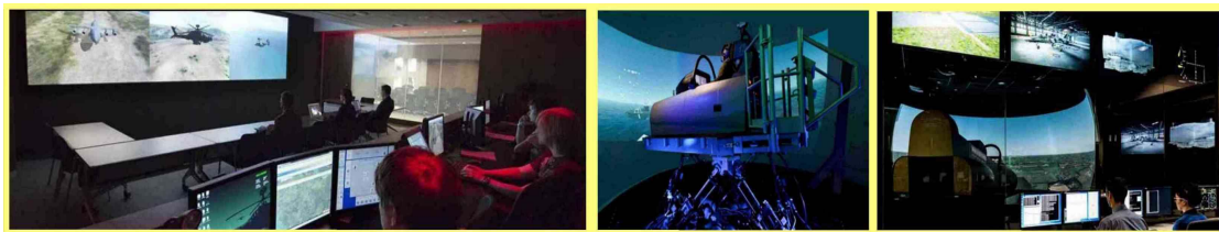
Pictures: ITEC 2016 Orlando exhibition hall, Boeing/QinetiQ Portal Farnborough, Warton F-35 sim, BAES sim integration facility