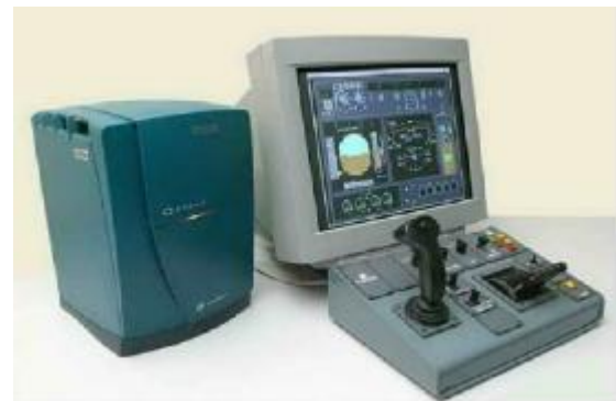
Figure 11 Airbus Desktop Development System

A range of engineering flight simulators is used from desktop systems (Figure 11), through to fixed-based simulators. The use of engineering flight simulators achieved significant reductions in cost and design time on the Boeing 777 and Airbus A380 programmes. Aircraft manufacturers also use 'iron-bird' rigs, fitted with actual aircraft equipment and systems, to verify the performance of actuators and sub-systems and to support systems integration (Figure 12).