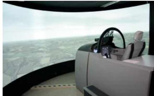
Figure 14 A University Flight Simulator

universities and with an established track record of research, to provide the answers needed for the next generation of engineers and flight crews.