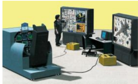
Figure 5 Aircraft Maintenance Trainer

mission rehearsal and crew resource management training.