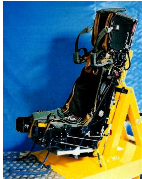
Figure 7 Military Flight Simulator G-seat

For military applications, where sustained G-forces cannot be simulated simply by displacing the simulator motion platform, these cues are provided by a special simulator seat, known as a G-seat (Figure 7). The base and sides of the G-seat are moved in response to perceived accelerations, applying pressures to the pilot's body that are similar to those felt during high G-force manoeuvres in flight.