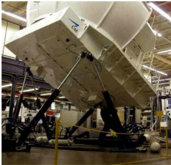
Figure 6 Civil Flight Simulator Motion System

Aircraft motion is simulated by moving the simulator platform vertically, fore and aft, and side-to-side, and rotating it about these three axes (Figure 6). This is a particularly challenging requirement for mechanical actuators, which must be adequately responsive to stimulate realistic acceleration cues, while ensuring safe, reliable and noise-free operation.