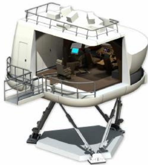
Figure 1 Civil Airline Full Flight Simulator

The complexity of both civil and military aircraft has increased as a result of advances in avionics, expanding flight crew training requirements and increasing the reliance on flight simulation. Many civil airlines operate large flight training centres to undertake their flight crew training and regular competence checking in order to maintain flight crew licences.