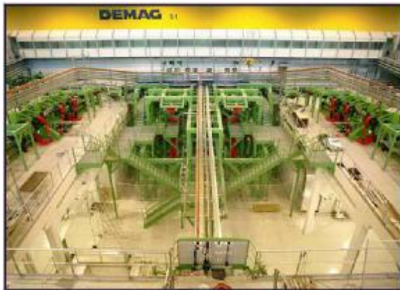
Figure 12 Airbus Iron-Bird Rig

The role of flight testing has changed significantly as a consequence of the capability of engineering flight simulators. It was used previously to verify the airborne performance of aircraft equipment; however, with advances in simulation and modelling, it may be used to verify results obtained from simulation. For example, in the Eurofighter programme, flight trials data were transmitted from the aircraft to the ground and analysed in real-time to ensure the validity of data derived in flight simulation, reducing the need to repeat flight tests.