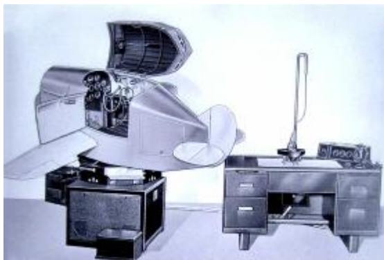
Figure 2 Link Trainer and Plotting Table

The Link Trainer was the forerunner of effective synthetic training devices (Figure 2). Developed in the USA in the late 1920s by simulation pioneer Edwin Link, and used during the Second World War, it provided over half a million allied pilots with essential training in instrument flying. Nowadays, such a device would be termed a part-task trainer or Flight Simulation Training Device (FSTD) as it was optimised for a specific set of training tasks, eliminating time that would otherwise be spent in an aircraft (or nowadays, in a full flight simulator).