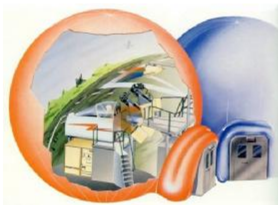
Figure 10 Military Dome Projection System

For military systems, where very large fields of view are required, an array of projectors may be used to display the image on the inner surface of a spherical dome containing the cockpit (Figure 10). In practice, the field of view is limited by the positioning of the projectors inside the dome. To provide an unconstrained view, helmet-mounted systems are used to display the visual scene using small optical devices mounted close to the eyes, slaved to where the pilot is looking.