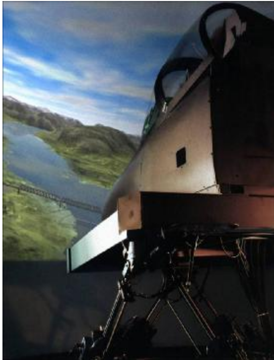
Figure 4 A Military Flight Simulator

aircraft. An area where simulator training has proved particularly effective is in mission rehearsal. Prior to an operational sortie, crews can practise in a flight simulator, often flying over unfamiliar territory, and are able to adapt the mission from the lessons learnt in the simulator.