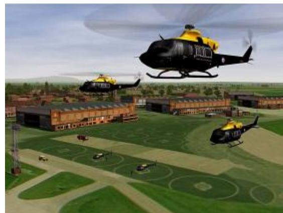
Figure 8 Flight Simulator Visual System

Visual cues are provided by computer-generated images viewed through the cockpit windscreen or in a helmet-mounted display. The observed scene must faithfully replicate all appropriate geographical features and airfields and be displayed with the correct depth of image and with the scene viewed without distortion by all flight crew, and possibly an instructor. This image rendering process is achieved by graphics engines, developed specifically for flight simulation or, more recently, adapted from PC graphics technologies. The quality of the images generated by a modern visual system is shown in Figure 8.