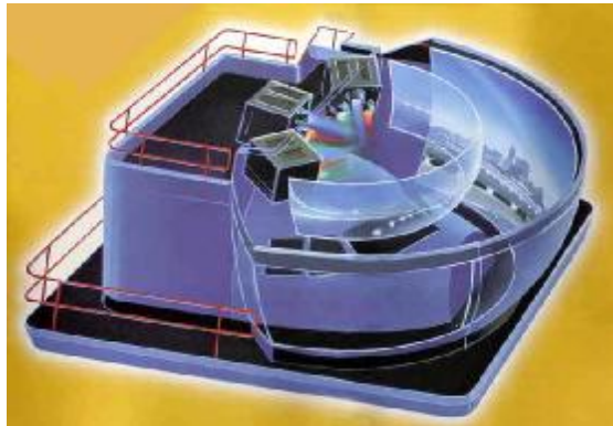
Figure 9 Curved Mirror Projection System

The most common type of visual system uses three or more projectors to display the image via a curved mirror (Figure 9).