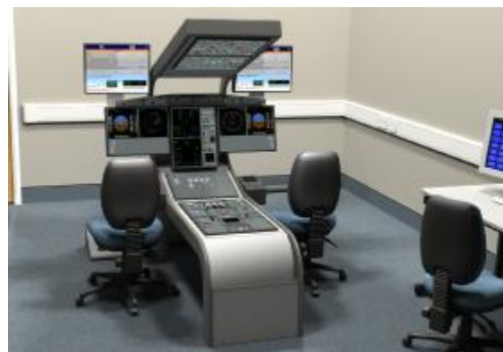
Figure 3 An FSTD

FSTDs are used as instrument trainers and flight navigation procedures trainers (Figure 3). Simple desktop training devices and laptop computers are also used to train flight crews and maintenance technicians, for example, to operate complex avionics or to practise engine start procedures without incurring actual engine wear and the associated cost.